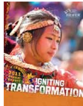
► 2011 ANNUAL REPORT